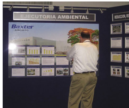
Posters & Exhibits - Baxter display

To view the conference presentations, visit: www.newmoa.org/prevention/cwm/pr/agenda.cfm .