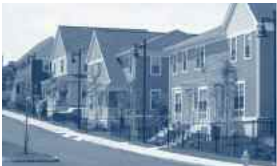
Residential Redevelopment - Before and After