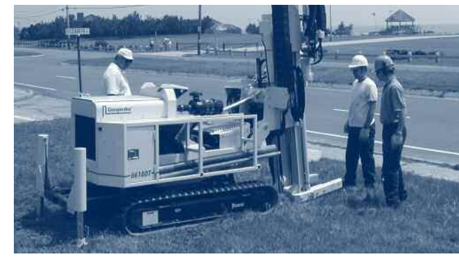
Geoprobe for soil and groundwater sampling

Also check the company's insurance coverage. You or someone whose experience you trust should review the policy in detail. This is critical because the consultant could overlook something, worsen the existing contamination, cause new contamination, or damage a third party's property. If the consultant lacks coverage for these types of incidents, you may be liable.