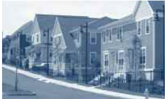
Residential Redevelopment - Before and After