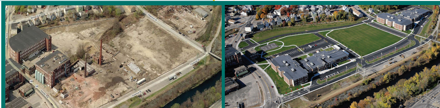
Woonsocket Middle School Campus – before and after

Clean up and redevelopment began in 2008 and the property is now home to two middle schools, an athletic complex, and multiple parking areas. The campus opened in January 2010 with more than 1,600 students.