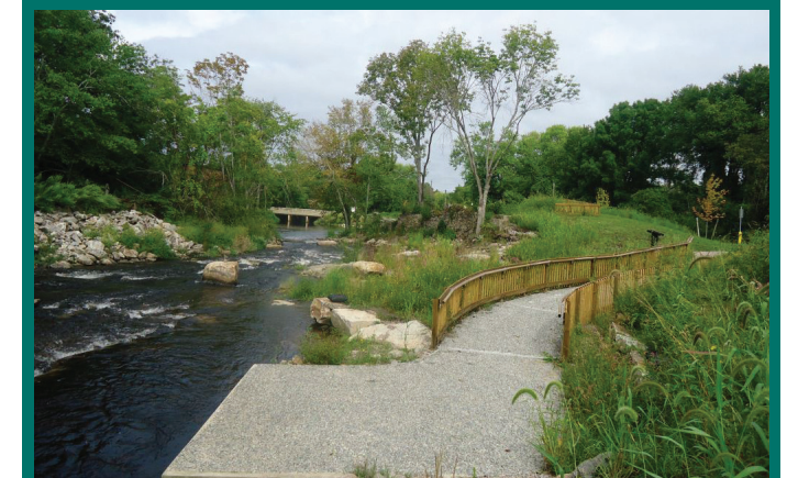
Knowles Mill Park – before and after