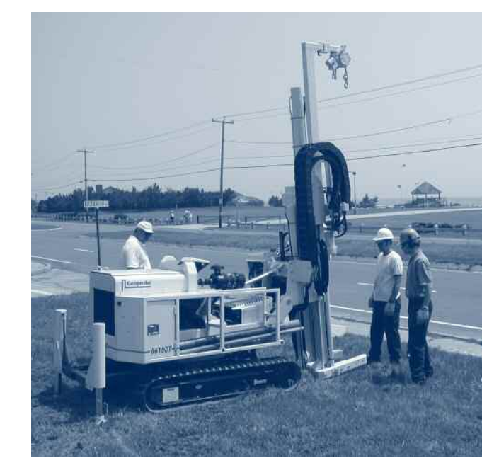
Geoprobe for soil and groundwater sampling

Also check the company's insurance coverage. You or someone whose experience you trust should review the policy in detail. This is critical because the consultant could overlook something, worsen the existing contamination, cause new contamination, or damage a third party's property. If the consultant lacks coverage for these types of incidents, you may be liable.