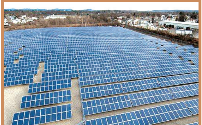
Indian Orchard Business Park – before and after

"From start to finish, this Project is an example of how state and local entities can work together for the good of the community. In Projects like these, the process can often get drawn out. MassDEP played a critical role in the coordination and helped streamline this effort to get the site cleaned up and ready for redevelopment. Various departments within MassDEP met every two weeks to ensure that the assessment, remediation, demolition, and redevelopment were progressing as they should. What used to be a blight on this neighborhood is now a source of pride. The community is thrilled with the end result of the 12-acre solar farm – the largest solar facility in New England."