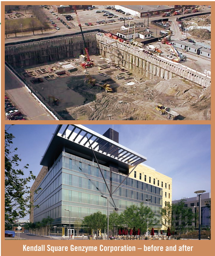
Kendall Square Genzyme Corporation – before and after