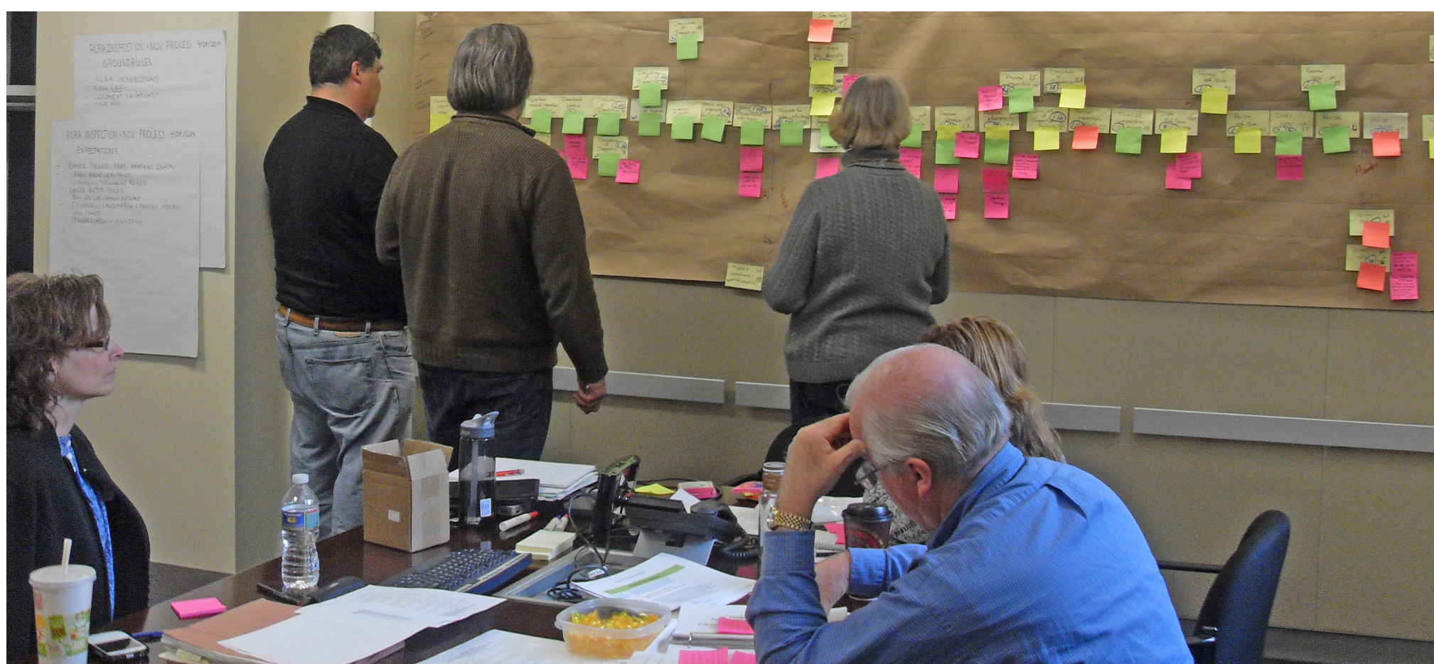
Mapping the process