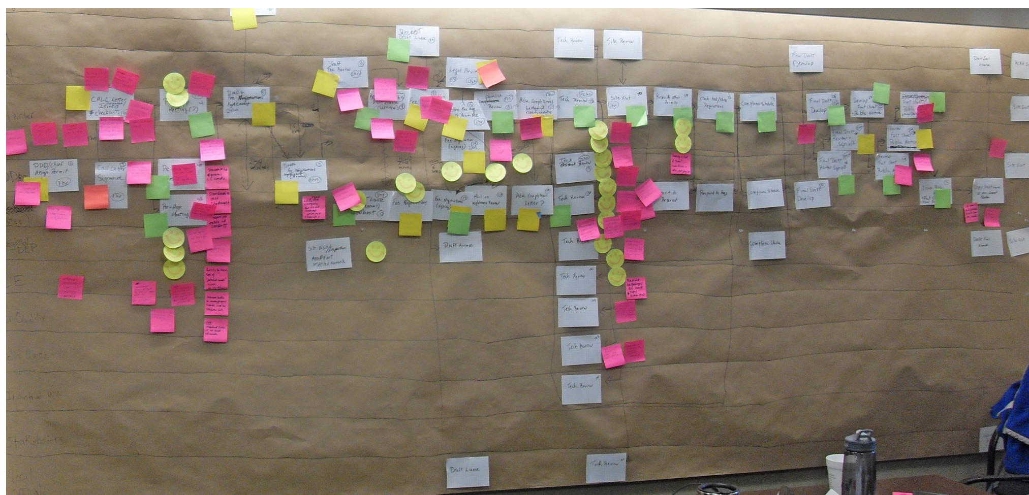
Present state map with opportunities identified and brainstorming ideas added