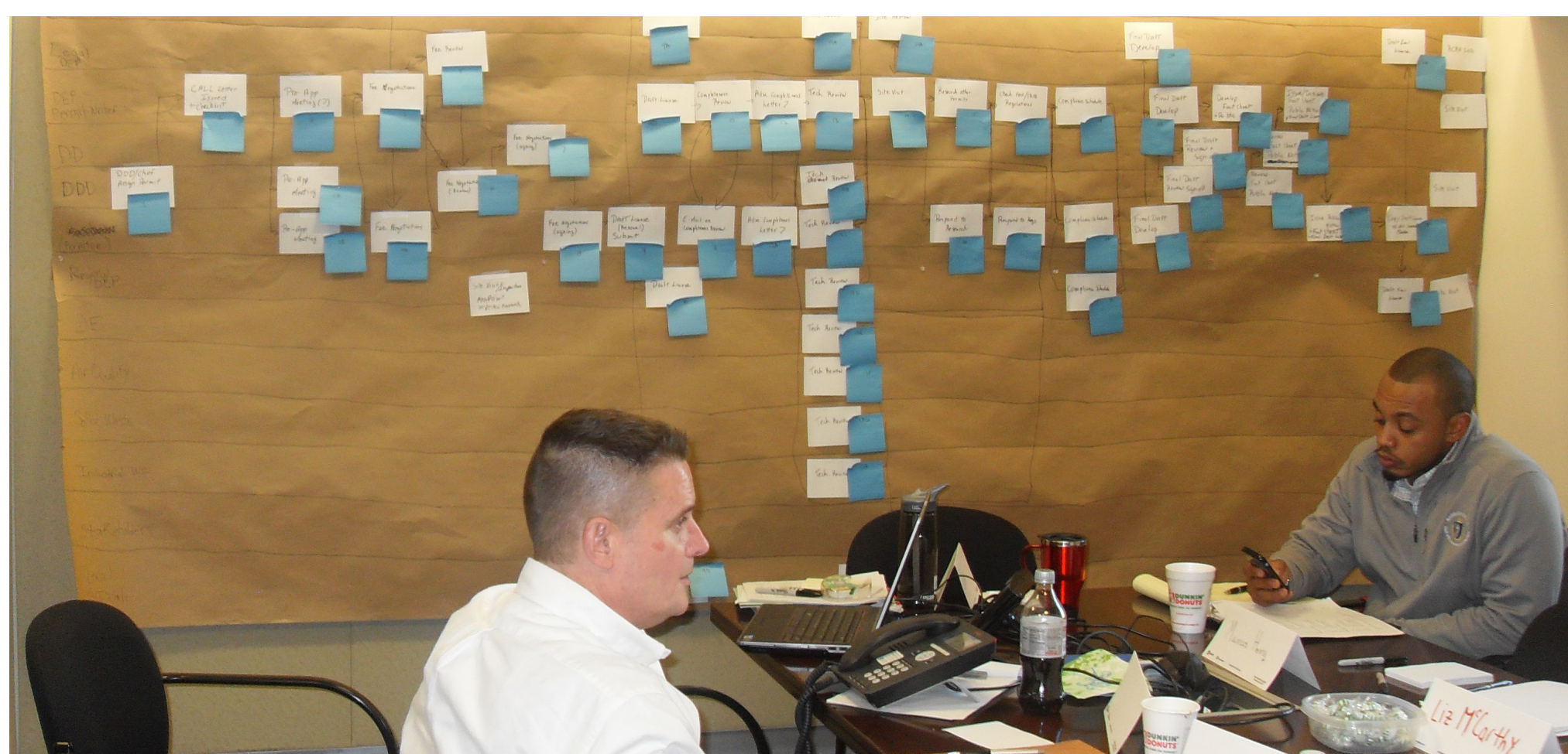
Mapping the future state process